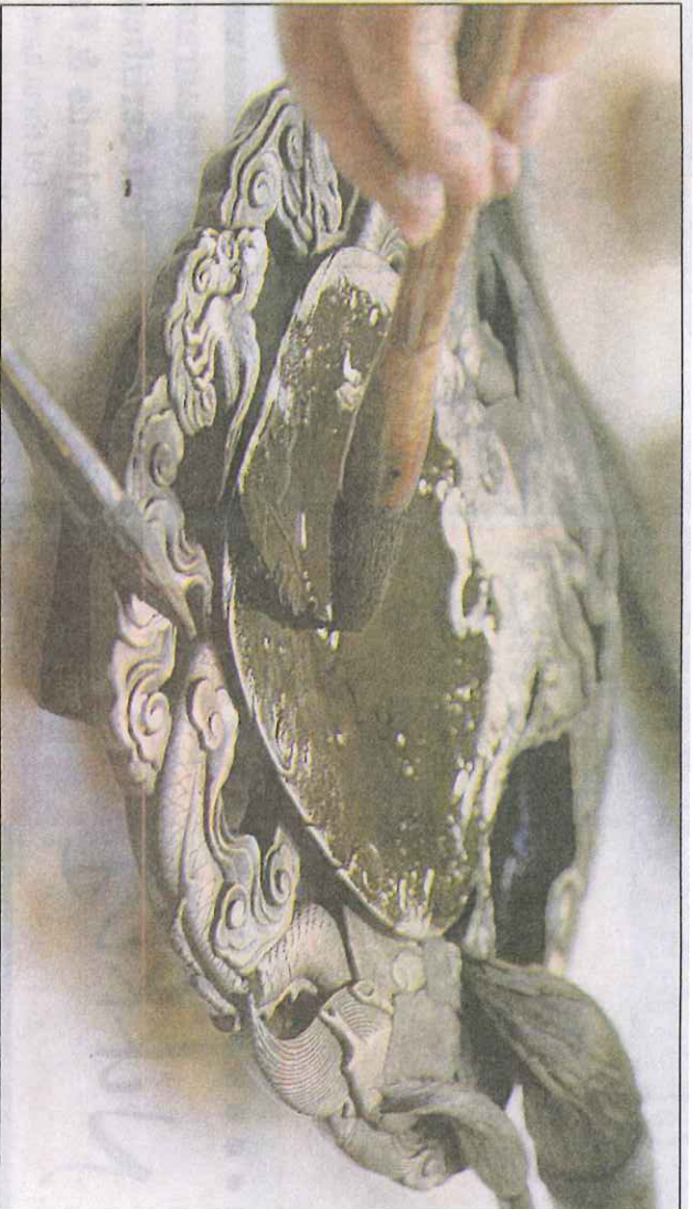
ABOVE: An artist dips his brush in paint during a calligraphy demonstration at the Bakersfield Museum of Art.